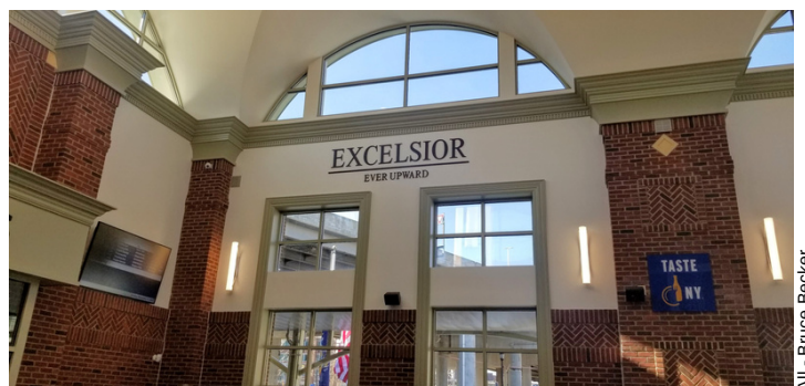
All - Bruce Becker

More Buffalo Exchange Street Station Photos At www.esparail.org