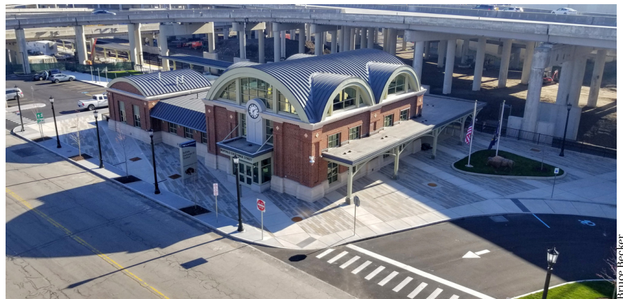
New Buffalo Exchange Street Station - More Photos On Page 10

The new $28 million station, completed on-time and on-budget, is located at the same location as the predecessor 1952-era building, but its position and scale provide a vastly more impressive appearance. The new building is twice as large and features a brightly sun-lit waiting room seating 40, complete ticketing facilities, a train-length high-level boarding platform, adjacent parking and a well-lit plaza walkway leading to Buffalo's Main Street, the NFTA's light rail line and the nearby Canalside and Harborcenter attractions. The station is open and staffed from 3:30am to 11:00pm daily (a major improvement over the previous limited weekday only hours).