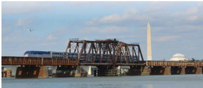
A VRE Train Crossing The Potomac River

Virginia is working with freight railroad CSX to triple track the DC-Richmond mainline while raising Amtrak speeds, removing 30 minutes from the current over 2-hours travel time, while also increasing Amtrak frequency to 15 round-trips by extending existing Boston-NYC-DC Northeast Regional trains beyond their current Washington Union Station terminus.