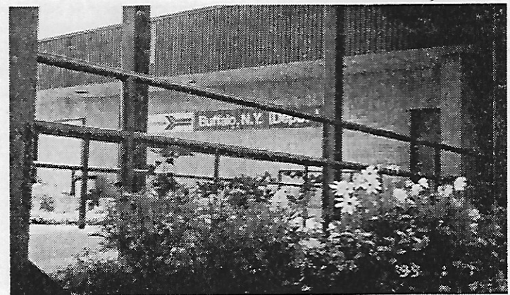
Thanks to Mischler's Florist and Greenhouses of Williamsville NY for donating the flowers to enhance the Buffalo-Depew station.

*- Spoke for Amtrak Appropriation increase but against Brown Amendment