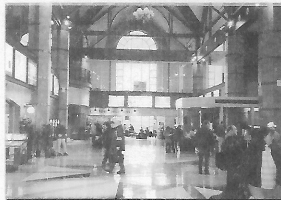
Main Hall at the Rensselaer/Albany, N.Y. Amtrak Station