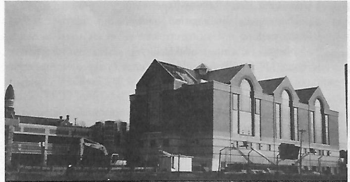
Work progress on the new Albany NY intermodal station and parking garage due to open in the spring 2001.

The 2001 Amtrak Travel Planner will soon be available at Amtrak stations or by calling 1 800 USA RAIL (a great planning aid to accompany an Amtrak Gift Certificate)