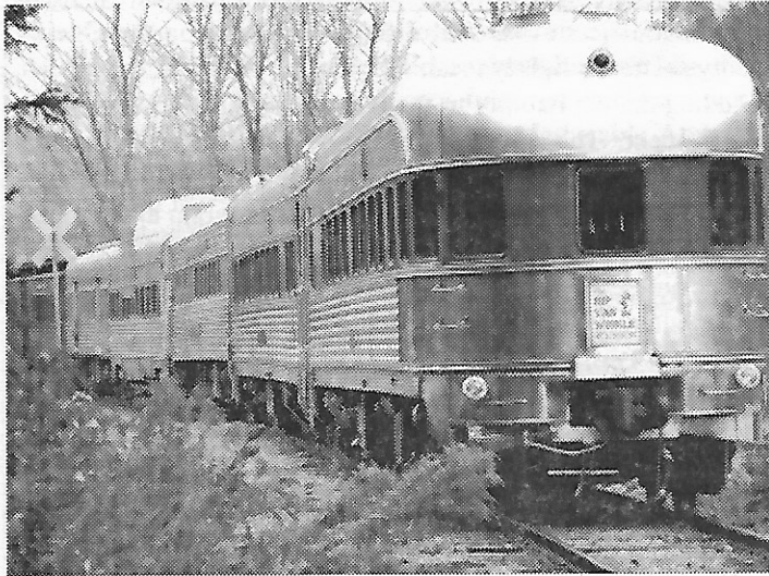
Silver Streak-Catskill mountain style! U&D passenger train is westbound for Roxbury. New York Central Parlor-Observation #61 brings up the markers in this mountain scene.

The October celebration hosted by the Ulster & Delaware Railroad Historical Society included a streamlined dinner train experience between the Delaware & Ulster RR's depot at Roxbury