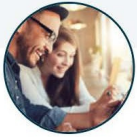
See New York and Save 15%

New York is a big state. An Empire State Passengers Foundation, alongside the Empire State Passengers Association, would help us achieve our goals of more trains having reliable, fast, and better service for all New Yorkers.