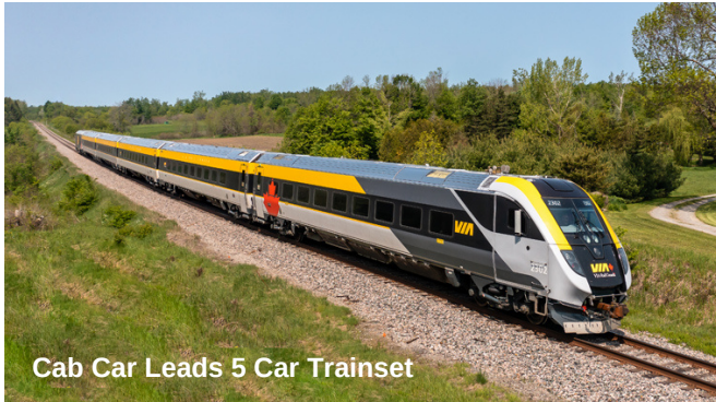
Cab Car Leads 5 Car Trainset