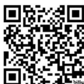
Scan To Register By Credit Card

_____ I will be arriving in Schenectady on: Tr. # 280 Tr. #63 Other